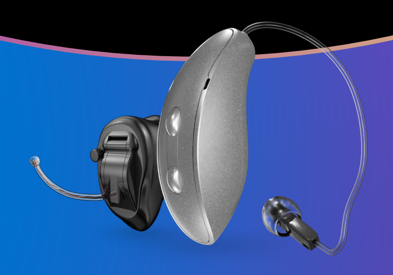
PRODUCT GUIDE 2024