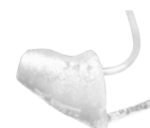
Stock thin tube solution

How to order custom Thin Tube and Standard Earmolds and Stock Thin Tube Solutions: